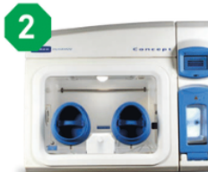
Concept 400-M Perfect for mid-range anaerobic or microaerophilic workloads