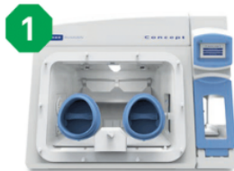
Concept 400 Perfect for mid-range anaerobic workloads

There are four models in the Concept range, each one carefully refined to suit your specific needs, with advanced ergonomic design providing excellent hand access and rapid plate loading. Ideal for varying capacity workloads and providing the best primary isolation rates for your anaerobic and microaerophilic cultures.