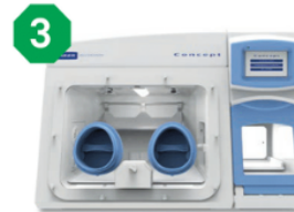
Concept 500 Perfect for mid-range workloads, with larger interlock