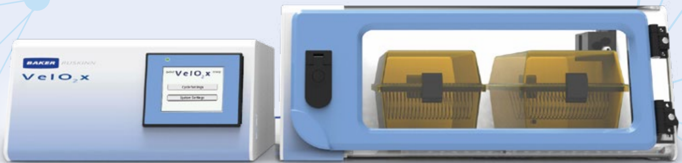
Fast O 2 ramping and fluctuation over 8-10 hours