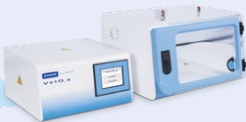
VELO 2 x 66L ANIMAL MODELING CHAMBER